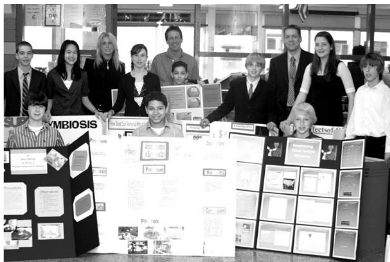
Science researchers from the West Hempstead High School and Middle School, with their teachers, were recognized with many awards this spring.