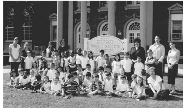
The children in the kindergarten class of 2008 visited the school they'll be attending in September, George Washington (pictured above).