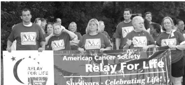
Teams displayed their banners as they walked the WHHS track during the 2008 Relay for Life.